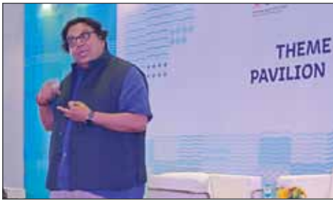
Shri Ashwin Sanghi Author