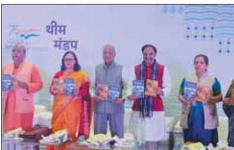
Shri Ramesh Pokhriyal 'Nishank' Former Minister of Education, Government of India