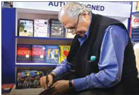
Shri Shiv Khera Author & Educationist