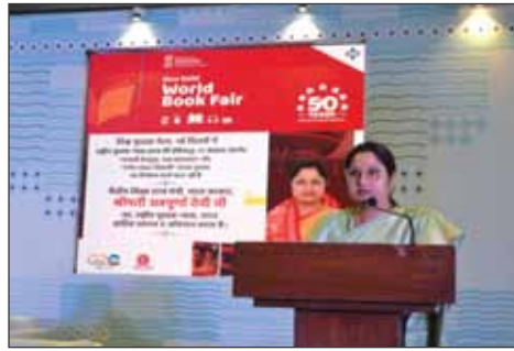
Smt Annpurna Devi Minister of State for Education, Government of India