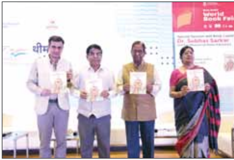
Shri Subhas Sarkar Minister of State for Education, Government of India

New Delhi World Book Fair is one of the largest International book fairs. It is an annual fair that attracts a huge participation from various publishers from India and abroad, authors and stakeholders. The fair is visited by booklovers, authors, celebrities, and dignitaries alike.