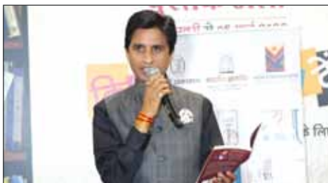
Dr Kumar Vishwas Poet, Author, Motivational Speaker