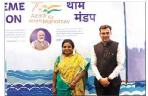
Dr Tamilisai Soundarajan Governor of Telangana & Lt. Governor of Puducherry