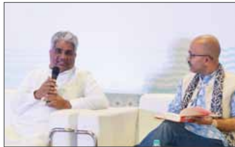
Shri Bhupender Yadav Minister for Labour & Employment, Government of India