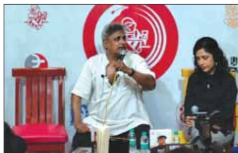
Shri Piyush Mishra Actor, Lyricist, Playwright, Poet, Composer & Singer