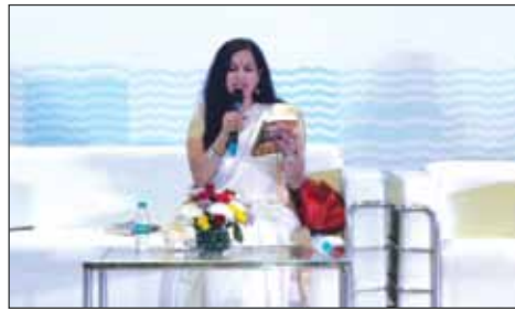
Ms Preeti Shenoy Author