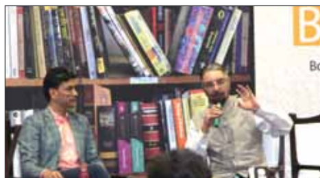
Shri Kabir Bedi Actor & Author