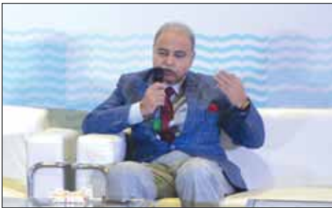
Shri Uday Mahurkar Information Commissioner, Government of India