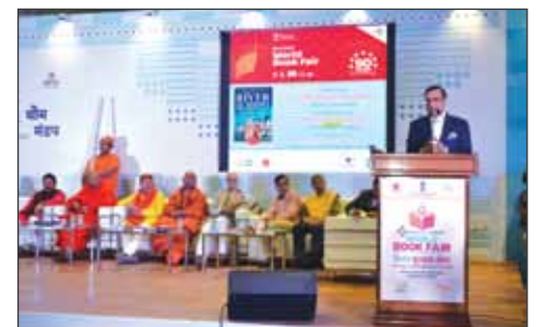
Padma Bhushan Shri Rajat Sharma Senior Journalist & Editor-in-Chief, India TV