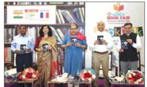
Prof. Manoj Kumar Jha Member of Parliament Rajya Sabha