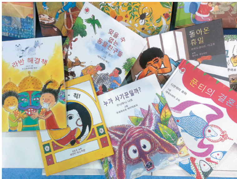
India's National Book Trust brought 10 Indian children's stories in Korean.

The NBT also brought 10 Indian children’s stories in Korean, a special presentation for the book fair.