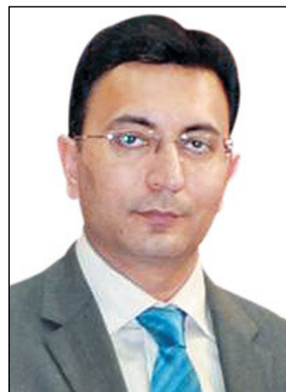
Jitin Prasada Minister of Human Resources Development

What makes this story special is the author.